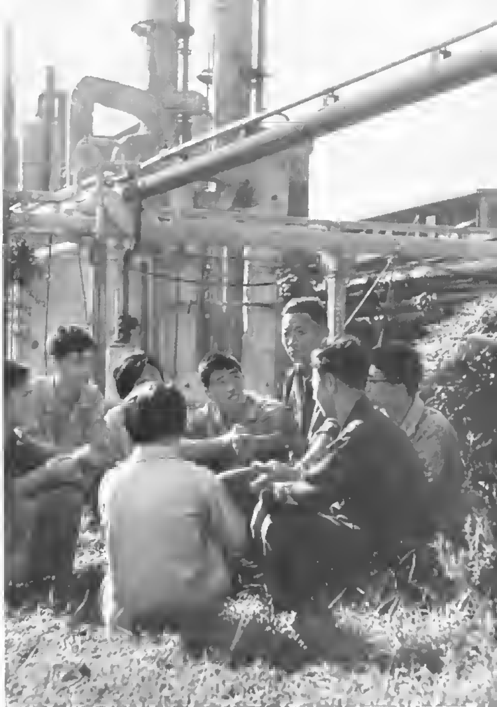
Exchanging experience in the application of Mao Tse-tung Thought to their work in a small rural fertilizer plant.

The General Line for Socialist Construction of the big leap forward year of 1958 inspired the revolutionary staff members and workers of the chemical industry. Deciding to apply Chairman Mao's call to "be self-reliant, work hard, do away with all fetishes and superstitions and emancipate the mind", they began to blaze a new path in the more rapid development of the nitrogenous fertilizer industry. Boldly they proposed moving the industry to the countryside. Boldly they designed new